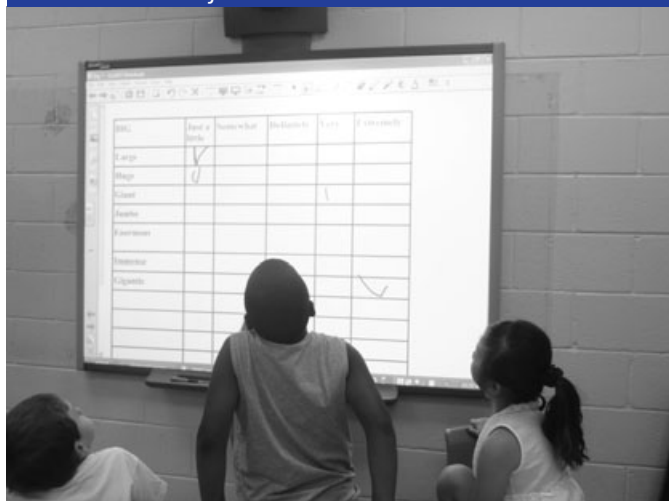
Figure 3 Debating Degrees of Meaning for Big Words on a Features Analysis Chart