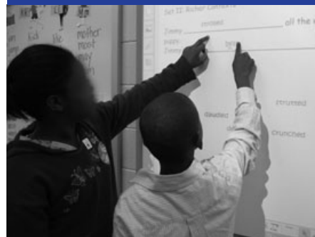
Figure 10 Selecting Words for Speed on a Semantic Gradient in Sentence Contexts

along continuums made by children in lines or projected on the electronic display board. As and after students heard or read The Christmas Blizzard by Helen Ketteman (1995), they pondered meanings of and ranked croaked , fizzled , and howled or settled , slipped , and barreled along semantic gradients describing different degrees of speed and loudness. For younger students and those needing more support, we found that allowing children to physically move themselves and their words helped extend their knowledge of relationships among known and new words and what semantic gradients are.